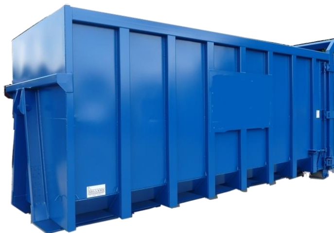
Figure 1 – Swansea University 35 yard roll on-roll off metal skip

See WMGN31 for guidance on contaminated metal disposal, such a swarf.